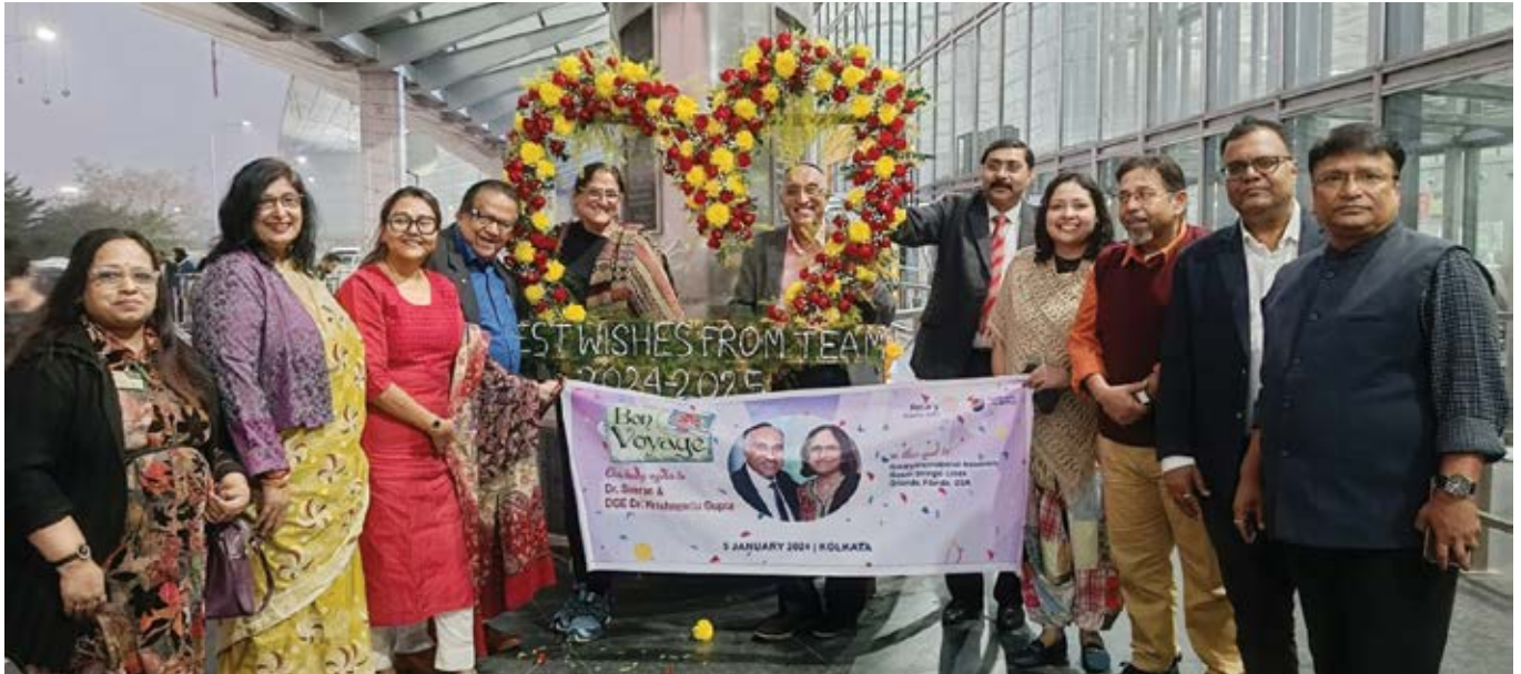
At Calcutta Airport (5/1/2024) Destination Orlando, Florida