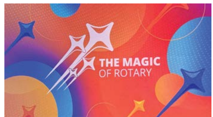
MAGIC OF ROTARY R.I. Theme (2024-25)