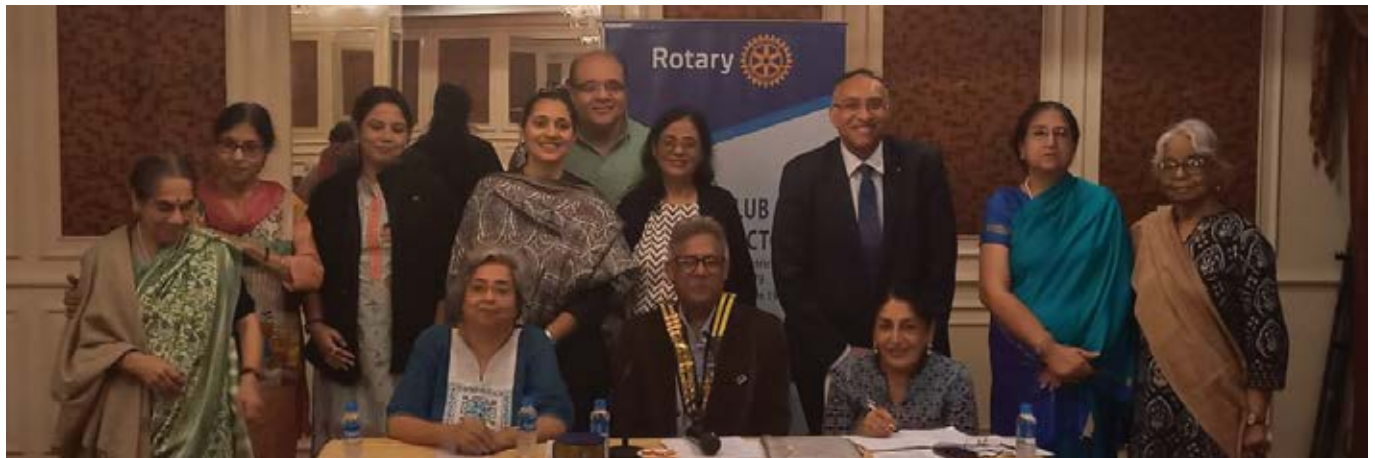
Team 2024-25. Announced at regular meeting on 30th December 2023.